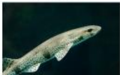
lesser spotted dogfish