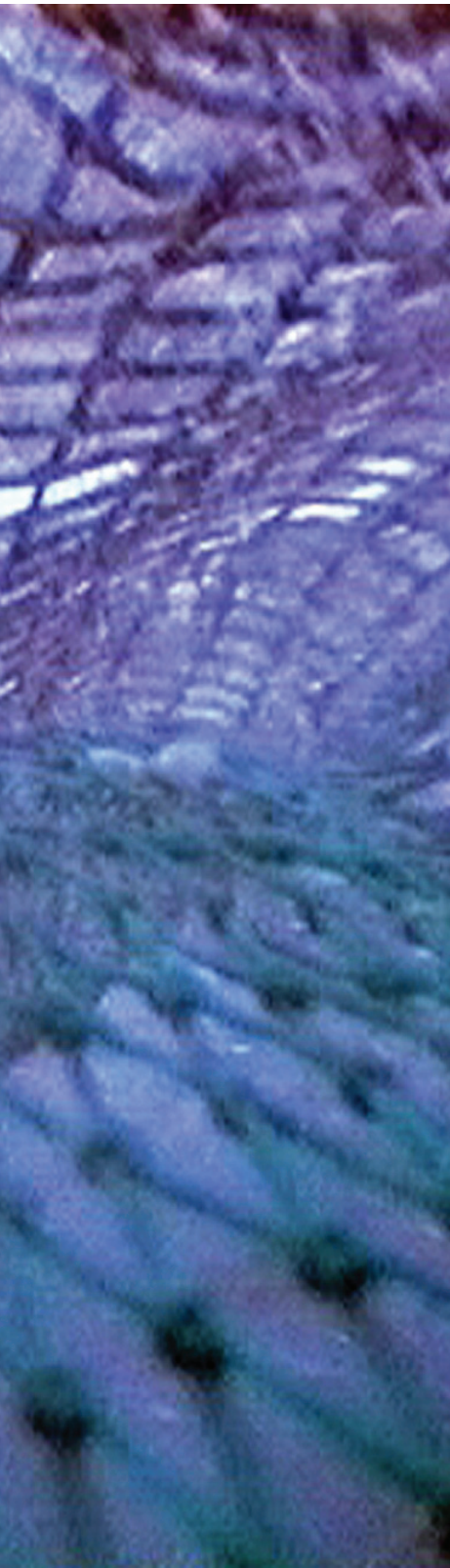
Square mesh panel in a full size trawl showing the difference between diamond on the bottom and square mesh on the top