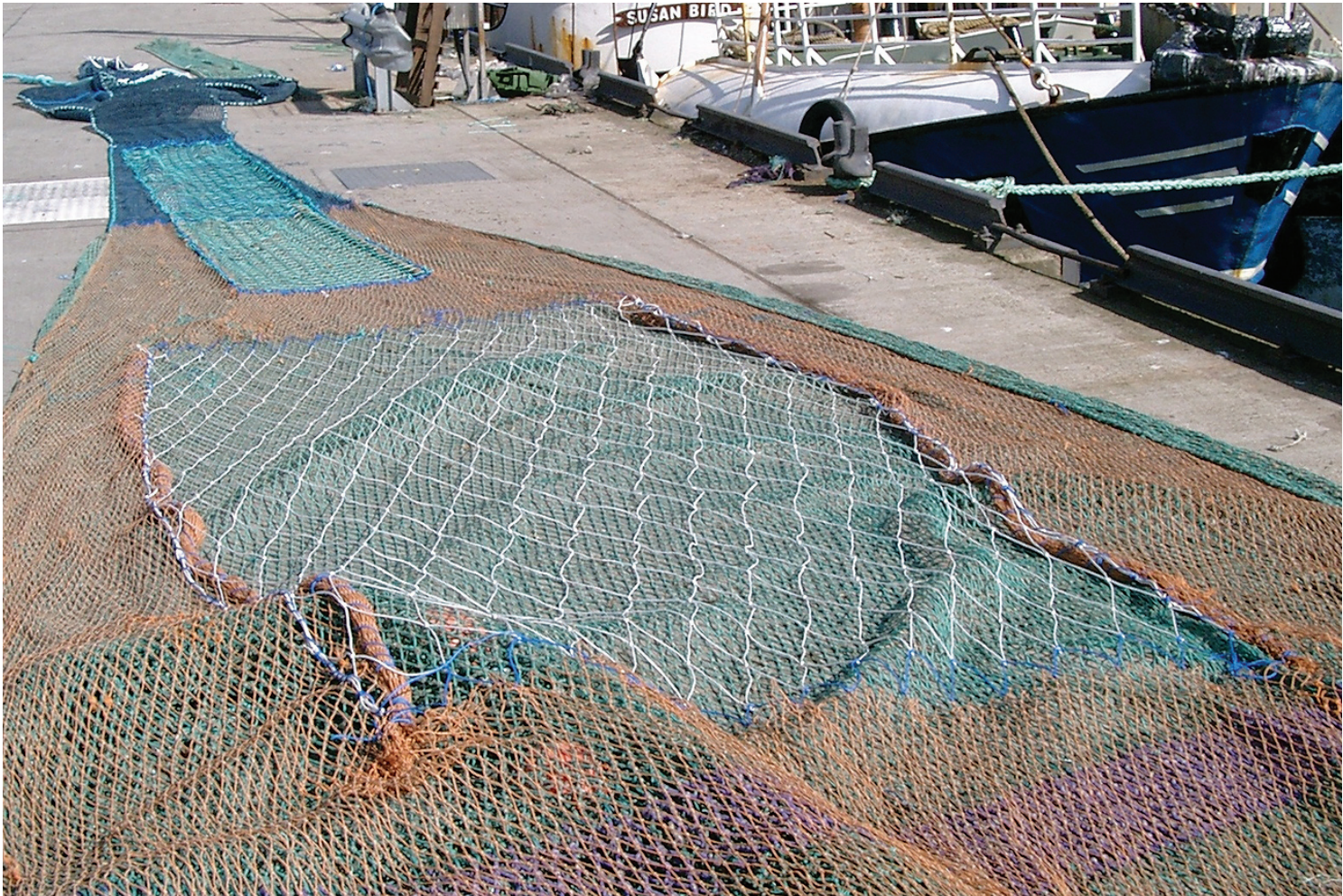
Large mesh (300mm) diamond mesh fitted in the top of a Nephrops trawl in conjunction with an extended square mesh panel of larger mesh

Options for fitting square mesh panels will be covered in the next article including in the belly of the trawl, cod ends and extensions and large diamond mesh panels.