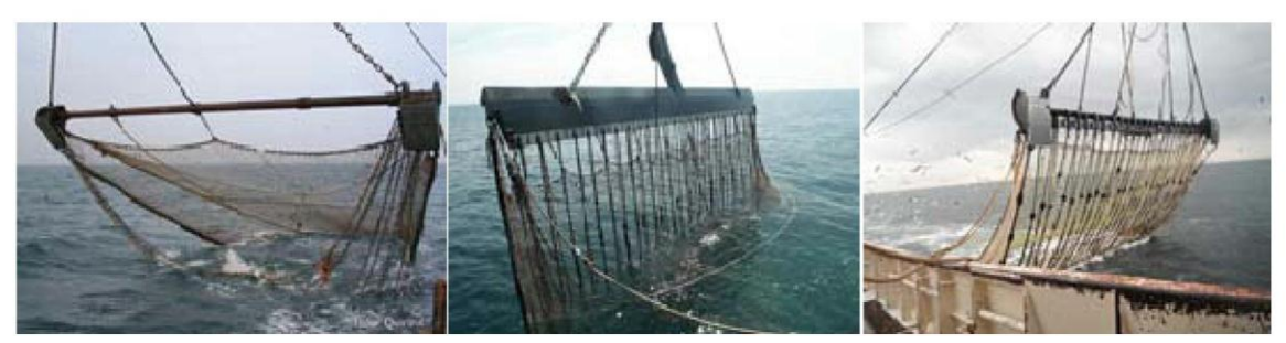
FIGURE 2.1. FROM LEFT TO RIGHT: TRADITIONAL BEAM TRAWL, HFK PULSWING, DELMECO PULSKOR

Flatfish spend a large part of their day on or in the seabed. In the flatfish fisheries, fishers use techniques to startle the fish from the seabed so that they can be lifted up into their nets (while steaming). In the conventional beam trawl fishery tickler chains are used to startle the fish (figure 2.1, left). These are steel chains attached along the breadth of the net opening or further back in the net on the ground line, which are dragged along the seabed.