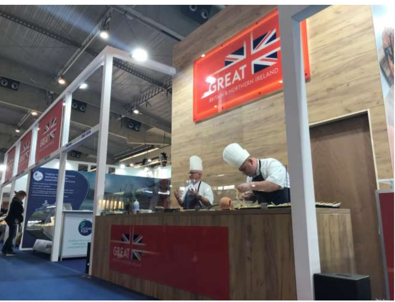
Page 30 of 30