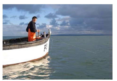
Left: Hauling the 20lb end weight and float Middle and right: Running along the backline