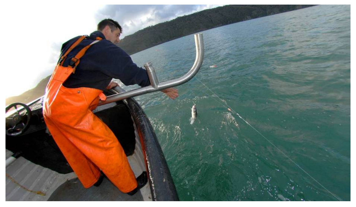
Hauling the gear using the "Fishfinger"

Steaming along the line is considerably easier with lines that are shot with the tide.