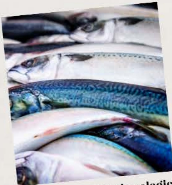
^ Northeast Atlantic pelagic stocks, including mackerel, are in danger of becoming drastically depleted.

Overfishing is an unacceptable threat to pelagic fisheries. Let's learn from past mistakes.