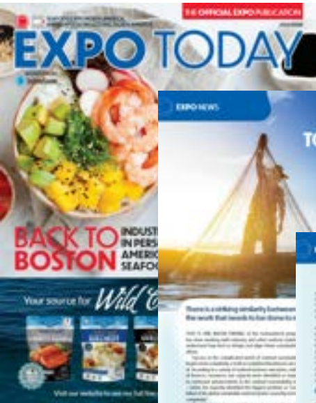
Seafood EXPO Today