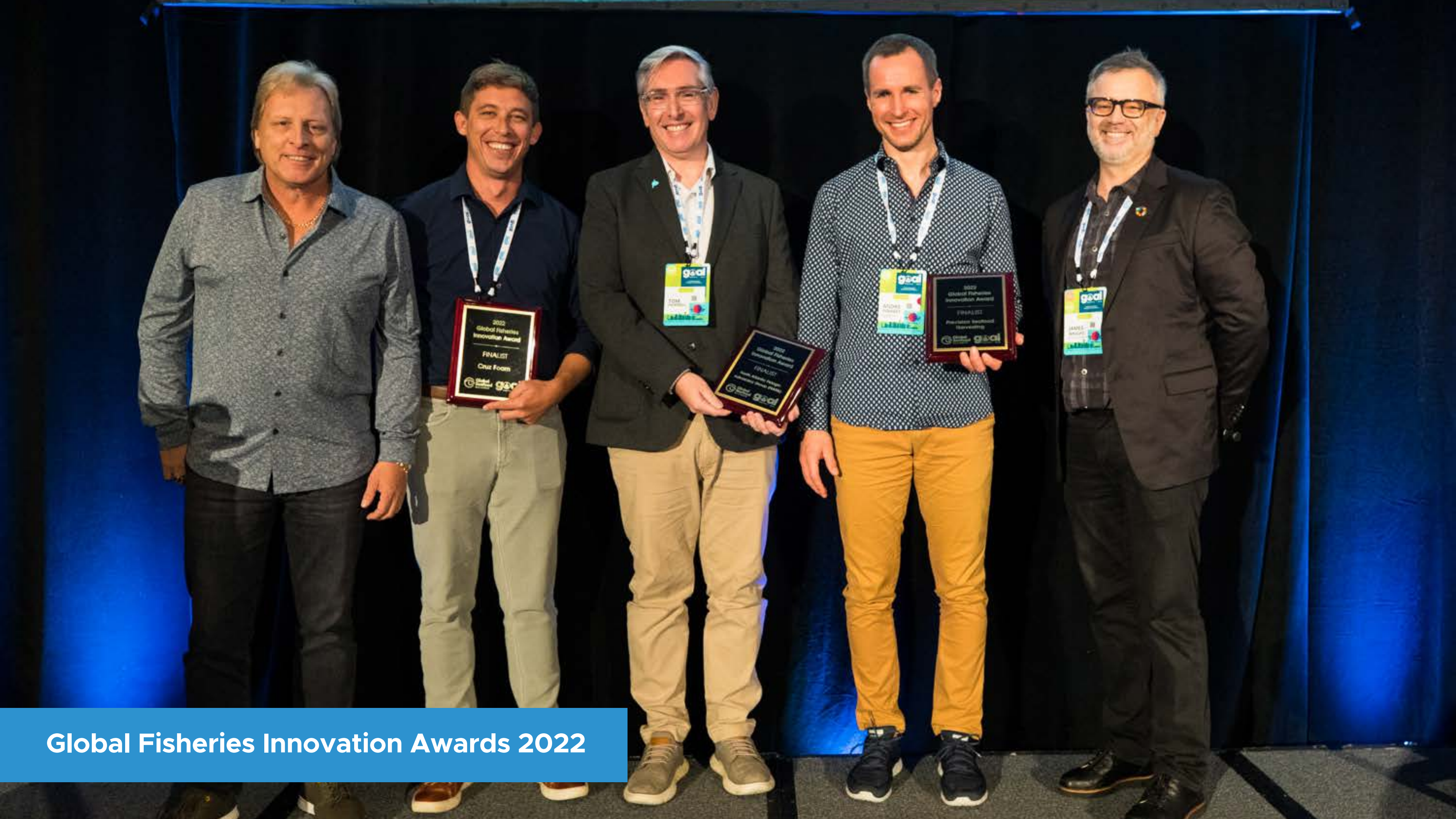
Global Fisheries Innovation Awards 2022