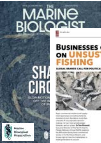
The Marine Biologist