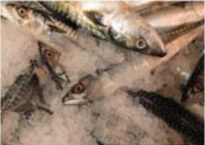
The ongoing failure to reach agreement concerns blue whiting, Atlanto-Scandian herring and particularly high-value mackerel

This year's fisheries on these stocks are marked by agreement last year on the TAC levels – but a failure to agree how that TAC should be divided between the coastal states concerned. As a result, there has been something of a free-for-all, in which the UK's exit from the European Union is seen as a contributing factor as a new coastal state at the negotiating table has complicated matters even further than in the past.