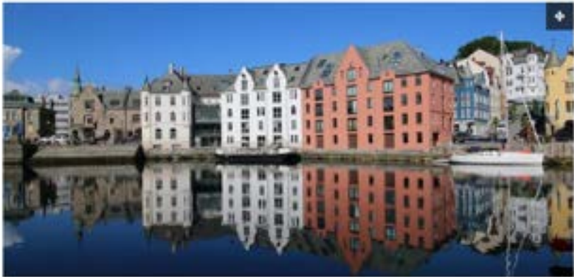
Nations must act decisively at critical moment for North East Atlantic mackerel