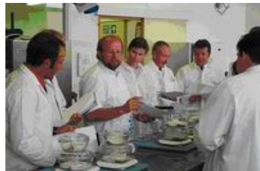
Figure 2. Fish quality assessment

Microbiological testing is also sometimes used to determine freshness quality. Total viable count (TVC) should not be used, as it is common for fish straight out of the sea to have a TVC of 1 \times 10^5 - 1 \times 10^6 . A better correlation is seen by measuring specific fish spoilage bacteria such as Pseudomonas or Shewanella species.