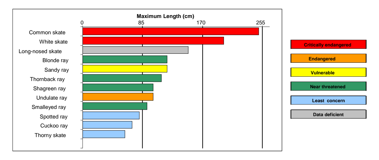
Table 2 : IUCN status of UK skate and ray species

The table illustrates IUCN criteria (16) of UK skates in relation to body size, illustrating how the larger-bodied skates are thought to have declined (and are of conservation concern). Medium-sized skates (including some of the more important commercial species) are of some concern, whilst small-bodied skates are not considered threatened. IUCN define their criteria in terms of 'extinction risk' - for many marine fishes this broadly equates with species that are depleted and 'outside safe biological limits' under ICES criteria (20).